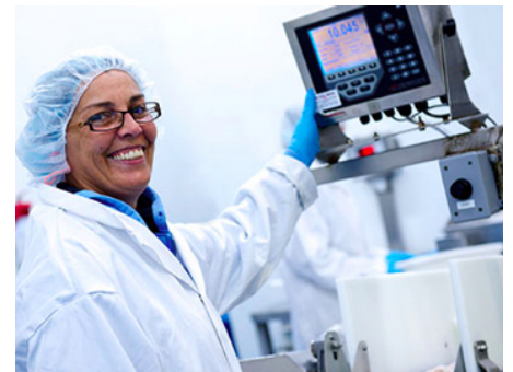
Supreme Quality Control Practices