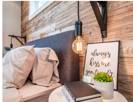
Wide range of indoor and outdoor applications