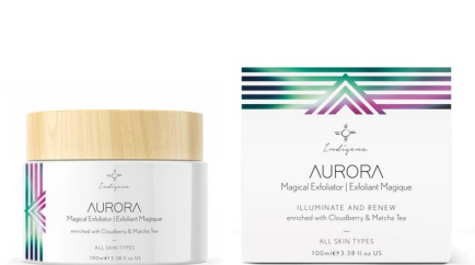
100% Natural Skincare Line of products

They are Indigena - healing beauty powered by the wonders of nature. 100% natural skincare created with wild grown botanicals hand harvested in the Canadian province of Newfoundland and Labrador. Their formulations balance scientific innovation with the natural power of this unique, resilient landscape. A blend of pure ingredients sustainably distilled from sea botanicals and indigenous northern boreal extracts. Working in harmony with the seasons, Indigena locally grow these indigenous ingredients. They craft pure, safe and effective products, on Newfoundland island, to care for your skin and the environment.