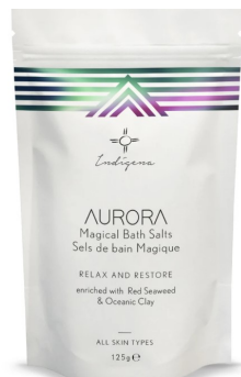
Blend of sustainable ingredients from the land and sea of Newfoundland