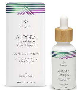
Botanical Pharmacy Hand Sanitizer