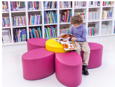
A Tradition of Innovation Customizable Options