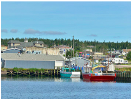
Sustainable Harvesting Policies