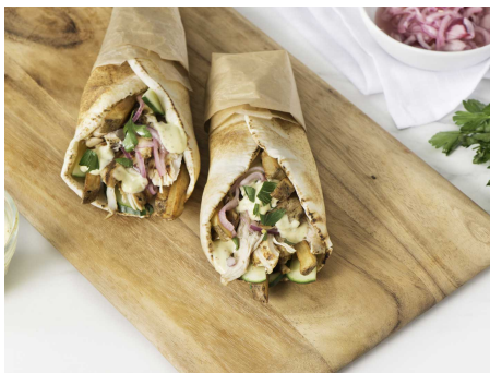
Quality Ingredients, Premium Products

Fancy Pokket has also mastered the art of baking gluten-free products branded as Timani Gluten-Free. Its 58,000 square foot dedicated gluten-free facility is one of the largest gluten-free plants in the world with state-of-the-art equipment. It produces loaf bread, hotdog/hamburger buns, loaf cake, muffins, cookies, brownies and more. It offers retail and foodservice products as well as private label and copacking services.