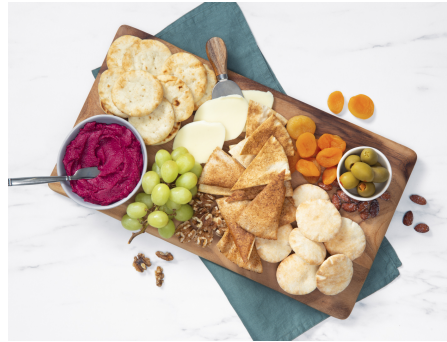
Retail, Foodservice, Private Label, Co-Packing Services