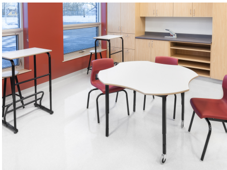
Limited Lifetime Warranty Made in Canada Quality

Ven-Rez is a leading Canadian manufacturer of educational, institutional and library furniture. Its reputation for product quality and durability has been tested by decades of use in both local and international markets. Schools who choose our student chairs, desks, and tables know that their investment will deliver long-term value. Ven-Rez is committed to “Building Better Classrooms” through design innovation and uncompromising quality!